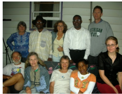
ERI 2007 Annual Meeting

this newsletter. One of the major highlights this year is our new partnership with UN HABITAT. After several years of building a relationship,