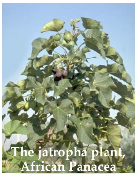
The jatropha plant, African Panacea