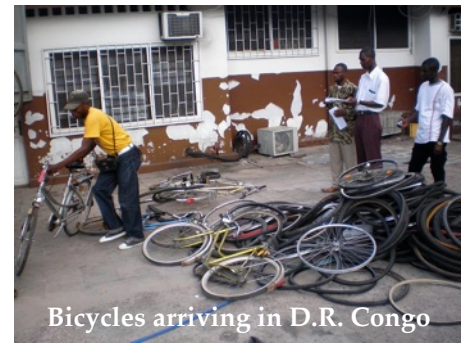
Bicycles arriving in D.R. Congo